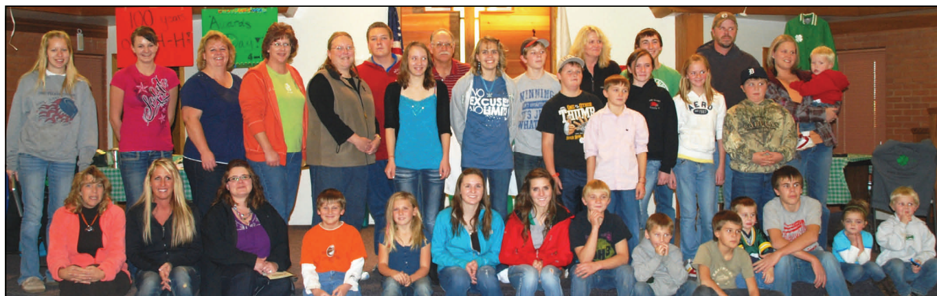
Valley County members and leaders were recognized at the annual Awards/Recognition day held November 13.

Are you a senior in high school this year? Please note that the deadline for the Nelson/Swanson Scholarship has been changed. The application and record book will not be due until September 1. You may stop in the office for further details. A letter and application will be sent out this summer.