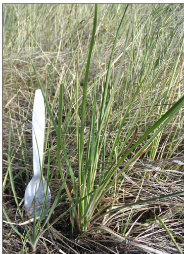
FIGURE 1. Western salsify rosette.

Western salsify has linear, grass-like leaves that clasp the stem at the base. Prior to bolting and flowering, the leaves can be readily mistaken for grass (Figure 1). However, they have a smoother and more rubbery-like feel than grass leaves, have hairs in the axils, and exude a milky juice when broken. The yellow, dandelion-like flower heads are born singly on 12 to 40 inch (30 to 100 cm) stems that are swollen and hollow below the flower head (Figure 2). Ten or more long, narrow involucral bracts extend beyond the flowers. There are 20 to 120 ligulate flowers per head. The flowerhead matures to form a three to four inch diameter fluffy sphere comprised of seeds with long, slender beaks and a white, umbrella-like pappus that aids wind dispersal (Figure 3). The fluffy sphere of seeds looks similar to that of a dandelion, only much larger. Western salsify has a thick, fleshy taproot.