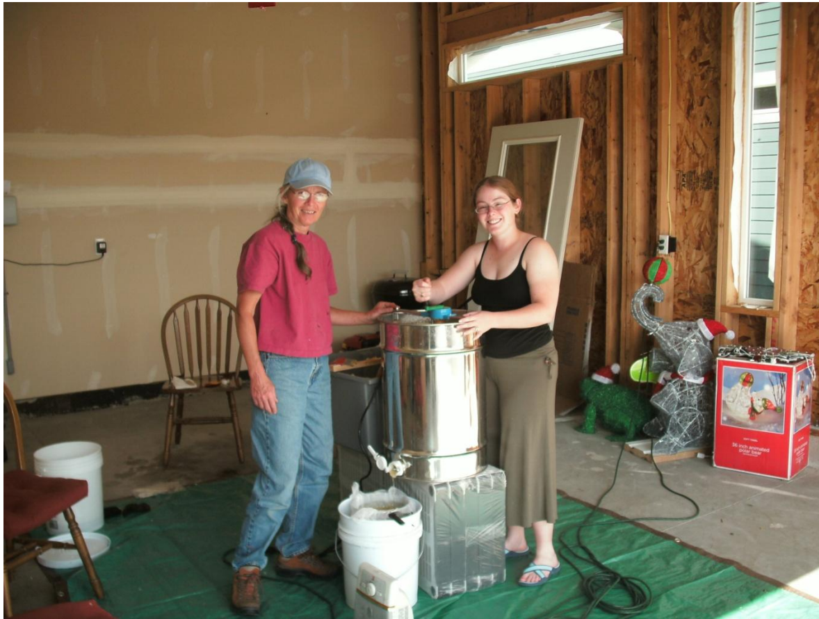
Honey Extraction Setup in my garage