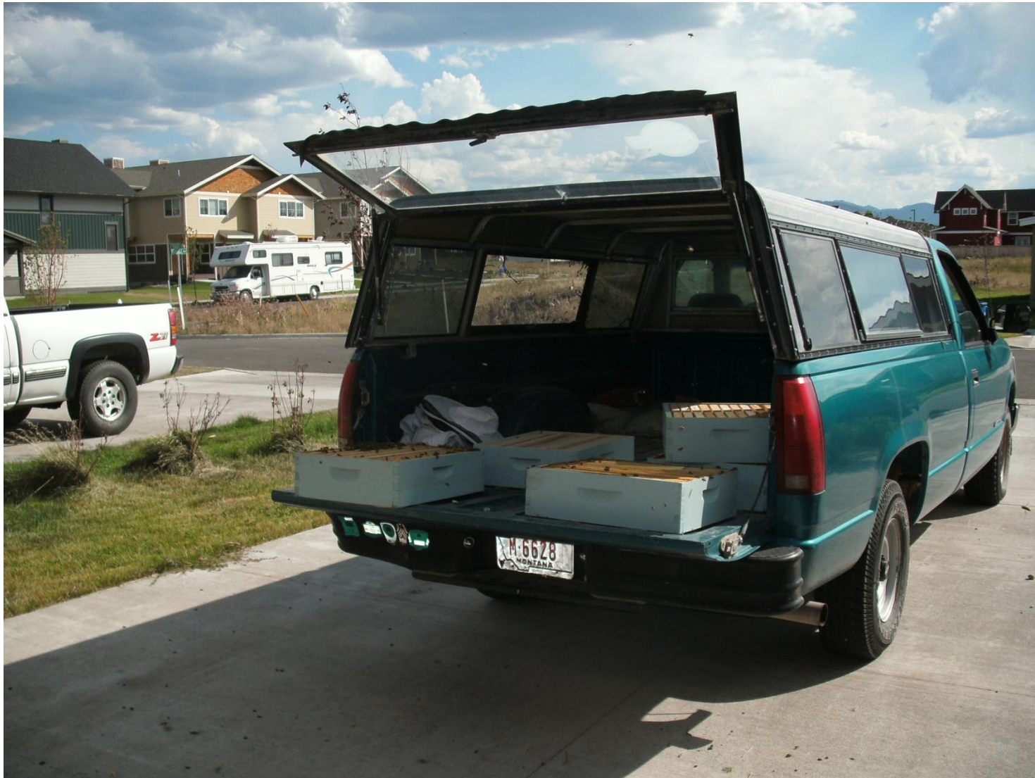
Honey supers from our bee hives