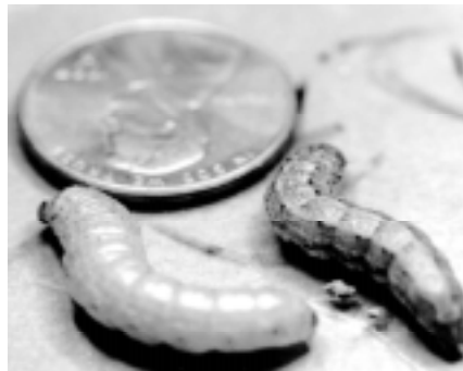
Figure 1. A pale western cutworm (left) and an army cutworm are shown with a penny.

eggs in late August and can continue through October. Up to 3,000 eggs are deposited per female on or just beneath the soil surface. Eggs hatch in the fall following rain or snow. This cutworm species overwinters in the larval stage. Larvae become active in late winter or early spring and are particularly damaging to winter wheat. Army cutworms feed above ground so evidence of feeding damage indicates their presence. However, they feed during night, from dusk to dawn, staying below ground during the day except on very overcast days when they can be found feeding above ground. This nocturnal behavior plus the small size of the early instar larvae (1.5 mm) makes them difficult to detect even though the