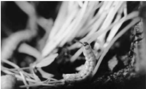
Figure 2 (at left). An army cutworm feeds on a canola seedling.