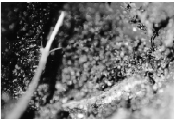
Figure 3 (below, left). An army cutworm burrows into soil at the base of a plant.

ied. The forewing of the adult has a prominent circular spot and kidney-shaped marking. The hindwing is grayish-brown with a whitish fringe. Larvae are greenish-brown to greenish-gray with the dorsal (top) side darker than the ventral (under) side. A narrow, pale mid-dorsal stripe is usually present. The head is pale brown with brown to dark brown freckles.